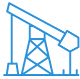
Oil & Gas Projects

Our vision is to address our clients' needs through a customized, efficient, and economically sustainable approach, integrating engineering expertise with proven on-site execution.