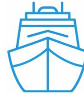
Naval & Marine Projects