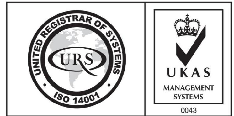
Certificate Approval N. 205559/C/0001/UK/ITN