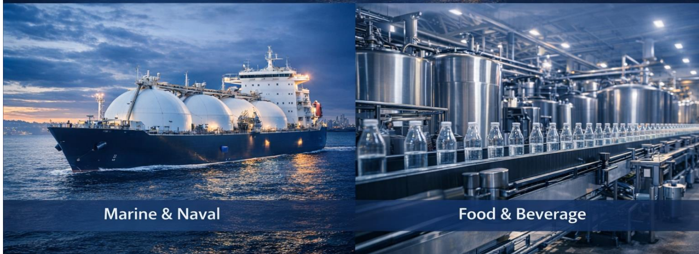
Marine & Naval