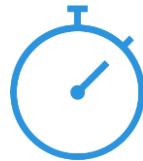
Rapid Mob / Demob